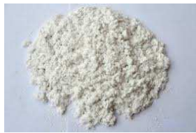
FLOCCO Grey Finish